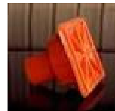
OSHA Certified Steel Inserted Rebar cap