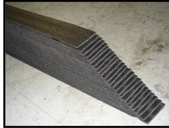
Rigid Foam Joints 5' length / 10' lengths