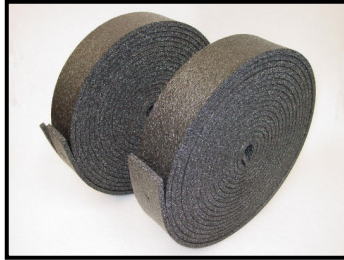
Non Crosslinked Polyethylene & Crosslinked Polyethylene