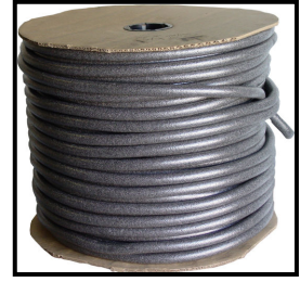
Standard Backer Rod All Sizes Available